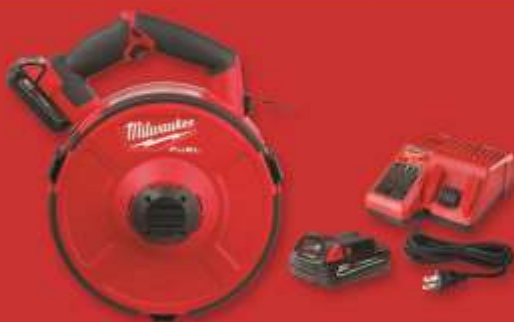
M18 FUEL™ ANGLER™ 240' Steel Pulling Fish Tape Kit 2873B-22

Includes: 2873-20 ANGLER™ Pulling Fish Tape Powered Base, 48-44-5176 ANGLER™ 120' x 1/8" Steel Pulling Fish Tape Replacement Cartridge, (2) M18™ REDLITHIUM™ CP2.0 Battery Packs and M18™ & M12™ Multi-Voltage Charger.