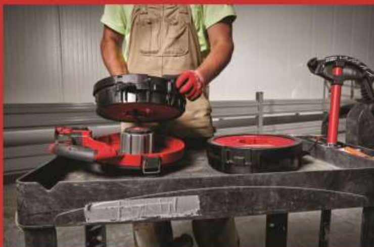
M18 FUEL™ ANGLER™ 100' Non-Conductive Polyester Pulling Fish Tape Replacement Cartridge 48-44-5195