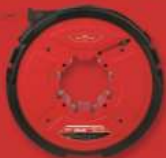
M18 FUEL™ ANGLER™ 120' x 1/8" Steel Pulling Fish Tape Replacement Cartridge 48-44-5176