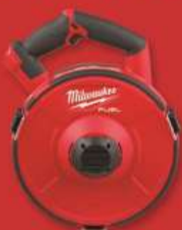
M18 FUEL™ ANGLER™ Pulling Fish Tape Powered Base (Tool-Only) 2873-20

Includes: 2873-20 ANGLER™ Pulling Fish Tape Powered Base, 48-44-5178 ANGLER™ 240' x 1/8" Steel Pulling Fish Tape Replacement Cartridge, (2) M18™ REDLITHIUM™ CP2.0 Battery Packs and M18™ & M12™ Multi-Voltage Charger.