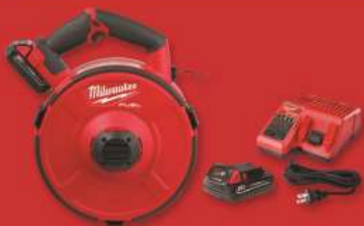
M18 FUEL™ ANGLER™ 120' Steel Pulling Fish Tape Kit 2873A-22

Includes: 2873-20 ANGLER™ Pulling Fish Tape Powered Base, 48-44-5176 ANGLER™ 120' x 1/8" Steel Pulling Fish Tape Replacement Cartridge, (2) M18™ REDLITHIUM™ CP2.0 Battery Packs and M18™ & M12™ Multi-Voltage Charger.