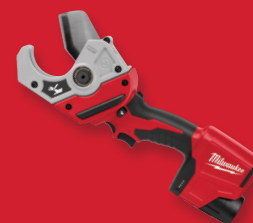
M12™ Plastic Pipe Shear Kit 2470-21