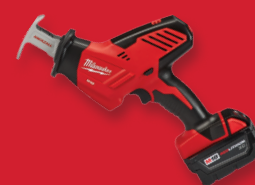
HACKZALL® M18™ One-Handed Reciprocating Saw Kit 2625-21