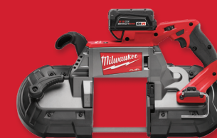
M18 FUEL™ Deep Cut Band Saw Kit 2729-22