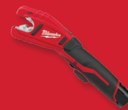
M12™ Copper Tubing Cutter Kit 2471-21